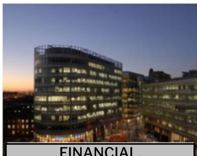
FINANCIAL, PROFESSIONAL & BUSINESS SERVICES