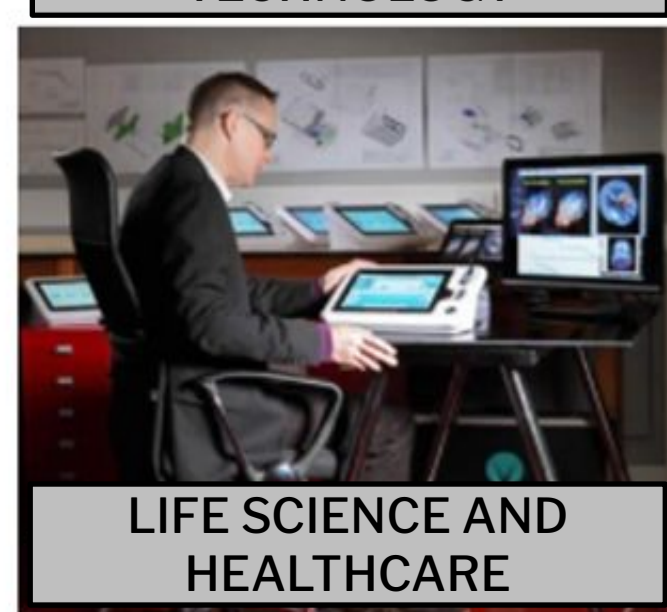
LIFE SCIENCE AND HEALTHCARE