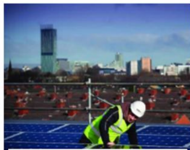
ENERGY & ENVIRONMENT