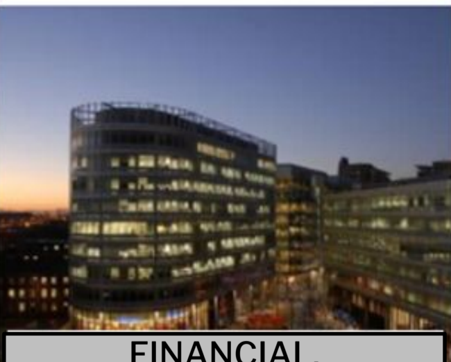
FINANCIAL, PROFESSIONAL & BUSINESS SERVICES